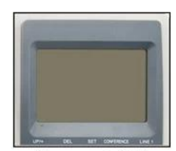
Super LCD Display Time, Date, Year