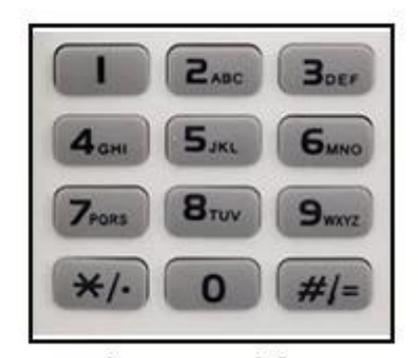
Large Key Easy to read