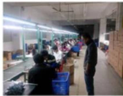
Finished product assembly